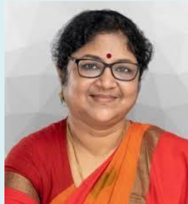
Inauguration Dr. R. Bindu Hon'ble Minister for Higher Education