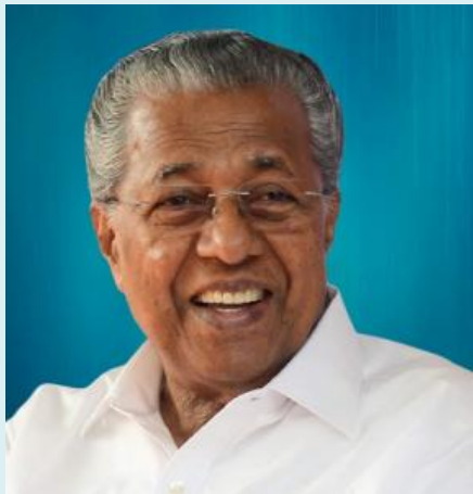
Sri. Pinarayi Vijayan Hon'ble Chief Minister of Kerala

Date: 12 th August 2025 Time 12.00 pm Venue: College Auditorium