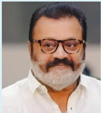
Key Note address Sri. Suresh Gopi Hon'ble Minister of State for Petroleum and Natural Gas, Minister of State for Tourism & Hon'ble MP, Thrissur